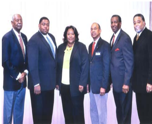
The Donald Lee Hollowell Foundation Board of Directors